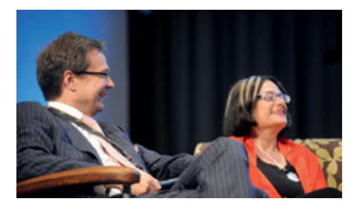
2013-14 IPMA Executive Board

IPMA has spread from Europe to Asia, Africa, the Middle East, Australia, and North and South America. The demand for our products and services and the number of our Member Associations is growing. Through IPMA, project management practitioners from all cultures and all parts of the world can network, share ideas, and move our practice and our stakeholders forward through effective collaboration and cooperation.